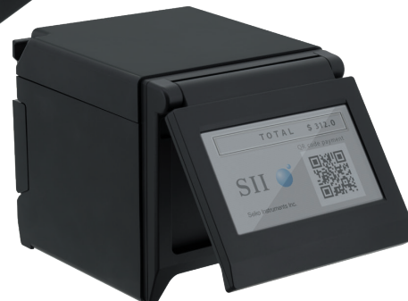
RP-F10 + LCD(Optional)