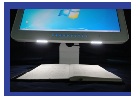
LED reading light bar