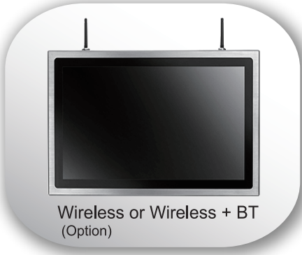
Wireless or Wireless + BT (Option)