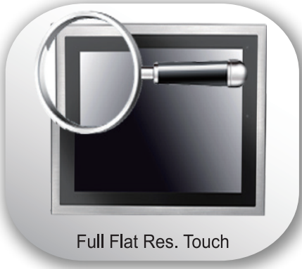
Full Flat Res. Touch