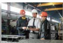
Industrial Operating System