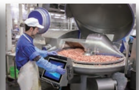
Animal Feed Production Facility