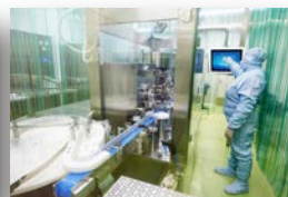
Chemical Critical Environment