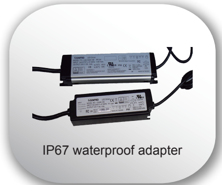
IP67 waterproof adapter